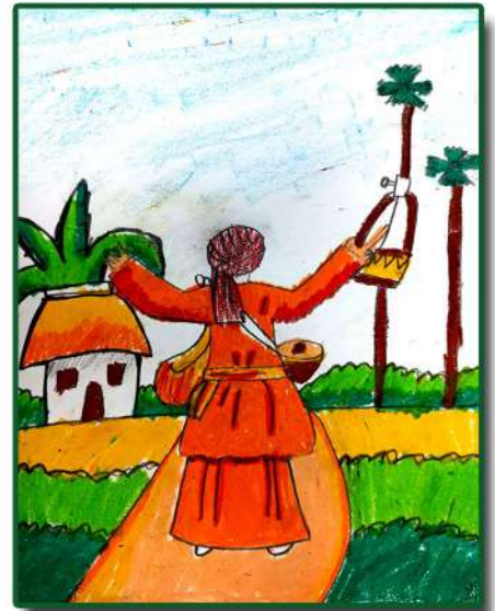
ATREYAN CHAKRABORTY IV-B