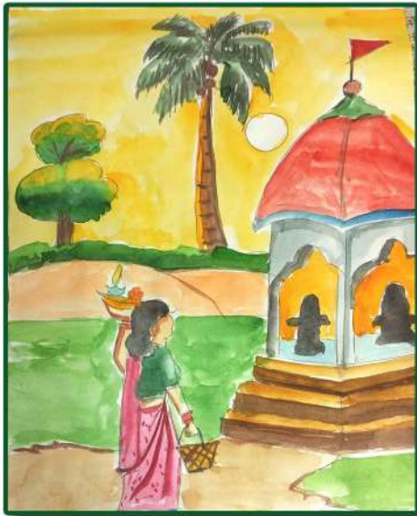
ARIKA PRABHAKAR IV-C