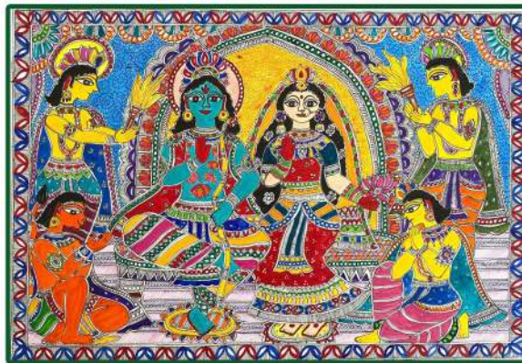
NAINA SINGHAL XII-H