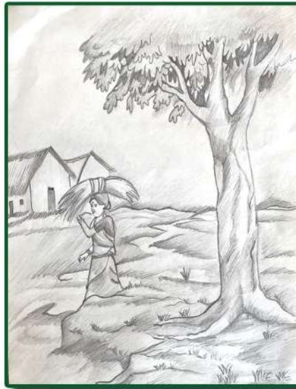
SHAUNAK BANERJEE III-C