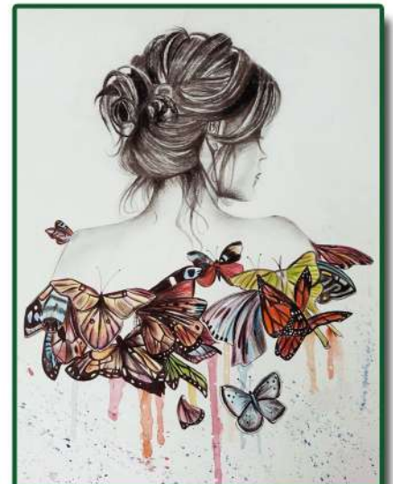
SAPTAPARNI DAS XII-A