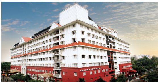
DPS Ruby Park, Kolkata