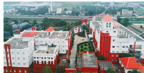
Omdayal Group of Institutions